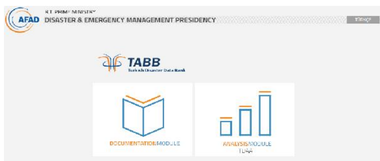
Figure 1. Welcome Page

TABB aims to contribute capacity building during disaster preparedness and mitigation stages of disaster management. Knowledge sharing and use of disaster data for scientific analysis help to improve mitigation strategies and policies to prepare stronger for future events.