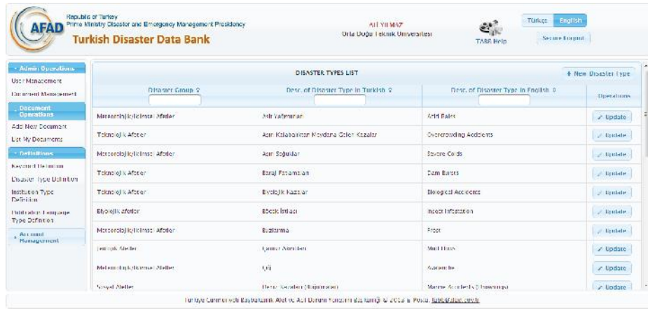
Figure 2. Keywords, Disaster Types