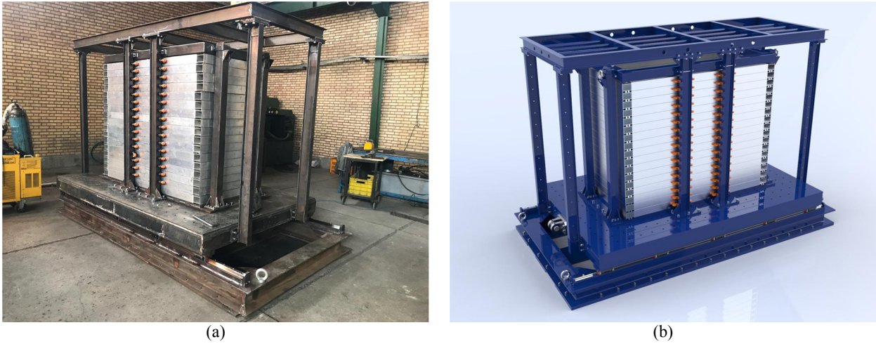
Figure 1. Overall view of the aluminum LSB; (a) Actual box before painting, (b) Box model using CATIA software.

In the end, the construction procedure of designed LBS is described step by step in full detail.