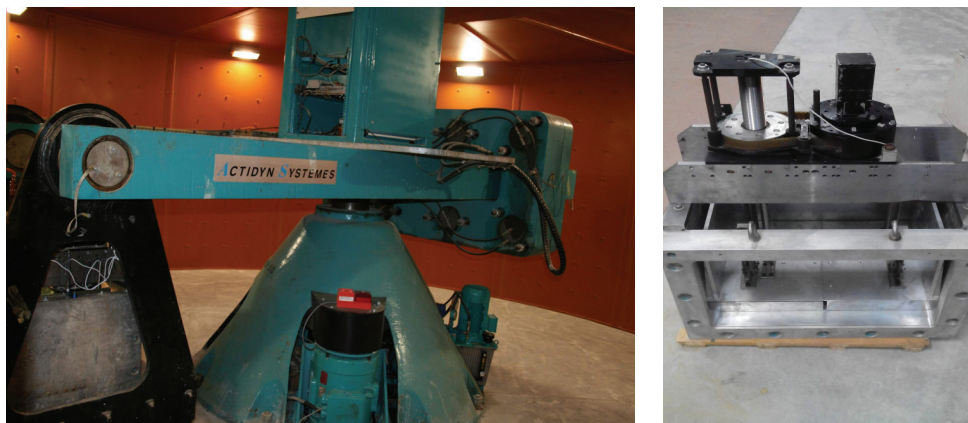
Figure 1. Centrifuge apparatus and split box that was used in current study.

In this study, geotechnical centrifuge of soil laboratory of International Institute of Earthquake Engineering and Seismology (IIEES) was employed to investigate faulting phenomena. This is the first study after assembling this centrifuge apparatus. A new split box was produced that can exert relative displacement to the soil layer. Dip angle of this split box is 90 degrees that can simulate a vertical faulting. The faulting was exerted to the model by using a steel shaft, connected to an electro motor. Centrifuge acceleration was chosen to be 40g that can model a 6 m soil layer (height layer of soil is 15 cm in model). 1.6 m vertical displacement (4 cm in model) was applied to the model. Split box has a dimension of 55 cm in length, 40 cm in width and 28 cm in height (Ahmadi, 2017). Figure 1 shows the centrifuge apparatus and split box that were used in current study.