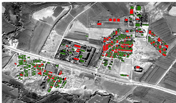
Figure 4. ANN's damage mapping using both pre-event and post-event images.

Both pre-event and post-event data were utilized and the damage detection algorithm reflects the changes. The input change indices are set as the relative differences (from pre_ and post_ data) of the seven Haralick textural features per individual building objects. In addition to these features, the statistical correlation values have been also computed for each individual objects (building property layout) considering both before and after satellite images having in mind that a higher values would reflect no detectable changes and vice versa. A total of 130 buildings were chosen randomly as the train data set from the reference ground truth data for damaged or undamaged buildings. Accordingly, a tailored ANN algorithm was employed for creating the entire damage map for the region. To assess the accuracy of the classification, a confusion matrix has been created based on the reference data and the model result showing an overall accuracy of 72% and a user accuracy of 84% for undamaged buildings. Figure 4 depicts a damage map where the red polygons show drastic changes and the green polygons represent non-detectable changes.