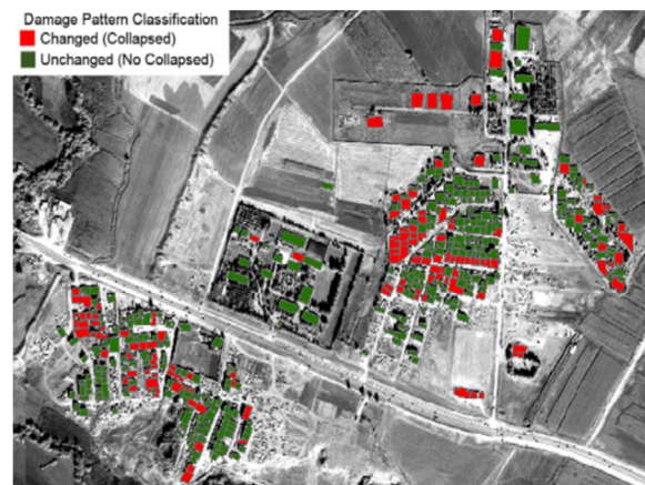
Figure 2. Reference damage map associated to post-earthquake satellite image.

The flowchart depicted on Figure 3 describes the steps involved in the object-oriented semi-automated methodology used in this research for citywide damage mapping.