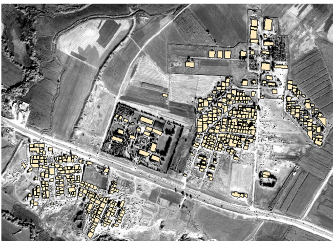
Figure 1. Building mask extracted from optical image.

In November 12, 2017, a strong earthquake (Mw 7.3) occurred on the Iran-Iraq border. In this event, the province of Kermanshah was the most affected area with the city of Sarpol-e Zahab being the hardest-hit zone. For this study, the Chinese TRIPLESAT_2 and SV1 satellite data sets were acquired for both before and after the event. The object-based image analysis has been sought where a building mask map was utilized for extracting textural contents from all building footprints from all images. The building mask has been created as a layer from Google Earth images (Figure 1). A ground truth data is necessary in order to train the ANN and in order to evaluate the outcome of the algorithm. This data can be derived according to a manual process or using an already existing damage data. Since the ground truth information and the survey data of the study area was not available, ground truth and reference damage map was prepared according visual interpretation post-earthquake satellite image. the buildings were classified into two classes of "Changed" or "Unchanged" (Figure 2).