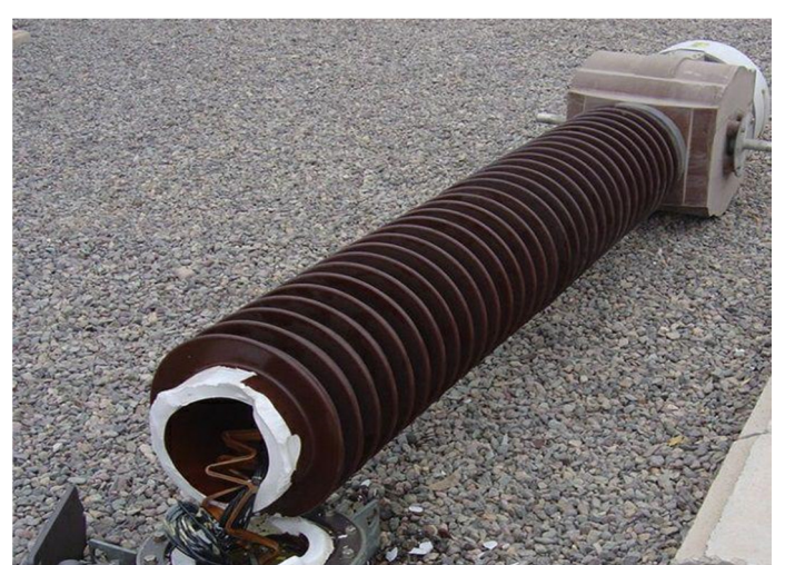
Figure 1. Failure of porcelain insulators in high voltage substations (Khalvati, 2008).

Lifelines play a vital role in the life of industrial and developed communities, and any failures in their proper function disrupts the activities and leads to great business interruption losses. Among different groups of lifelines, the power industry is more important due to its widespread use. One of the key elements in the process of transmission and distribution of electric power in the networks are the Substations. The study of recent earthquakes indicates that the vulnerability of equipment inside the substations are really noticeable (Figure 1). One of the main problems in this area is the lack of seismic design provisions for these elements and poor design assumptions.