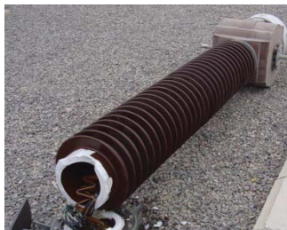
Figure 1. Failure of porcelain insulators high voltage electrical substation (Khalvati et al., 2008).

Lifelines are the facilities that the life in industrial and advanced societies is possible only by ensuring their appropriate and permanent operation and functioning. One of the most important lifelines is electrical power equipment which considering the effects of recent earthquakes in the world, high voltage current transformer, due to limitation of the materials used to manufacture the porcelain insulator part, are the weak and vulnerable parts of the electrical power equipment in earthquakes (Figure 1).