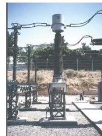
Figure 2. The studied current transformer (Khalvati et al., 2008).

In this study, firstly, the seismic behavior of the structures and equipment of high voltage electrical substations and their behaviors in the past earthquakes have been investigated. One of these elements, which is the high voltage current transformer 230 kv (Figure 2) has been selected as an important and key element in the electrical power substation. Subsequently, the seismic vulnerability of the equipment due to changes occurred in lateral stiffness of the supporting structure has been studied more carefully. For this purpose, first, the primary data of the equipment, such as technical specifications, dimensions, weight, the elements used and the stiffness of each, etc., have been collected.