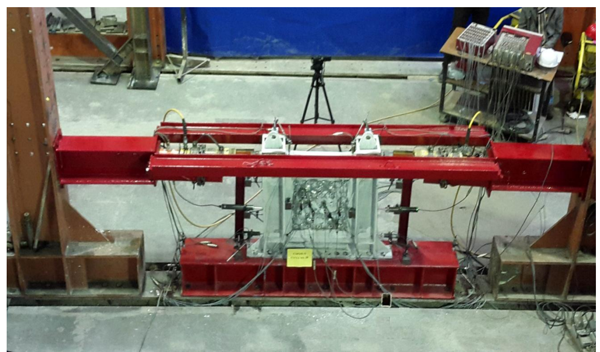
Figure 2. The dimensions of CSPSW specimen and test set up