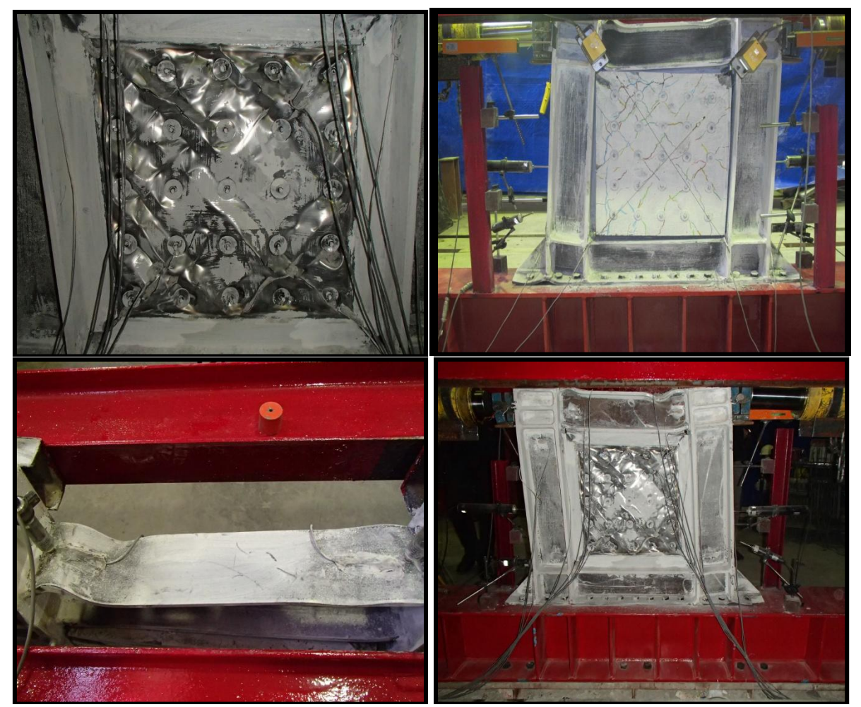
Figure 4. The CSPSW specimen after the test

Important experiment observations in each loading group are summarized in table 1. According to test results, the specimen depicts an authentic ductile behaviour and an acceptable failure mode. The CSPSW specimen reaches inter-story drift of 6%, and by the fracture of left column, the test was terminated. Figure 4 depicts the CSPSW specimen after the test.