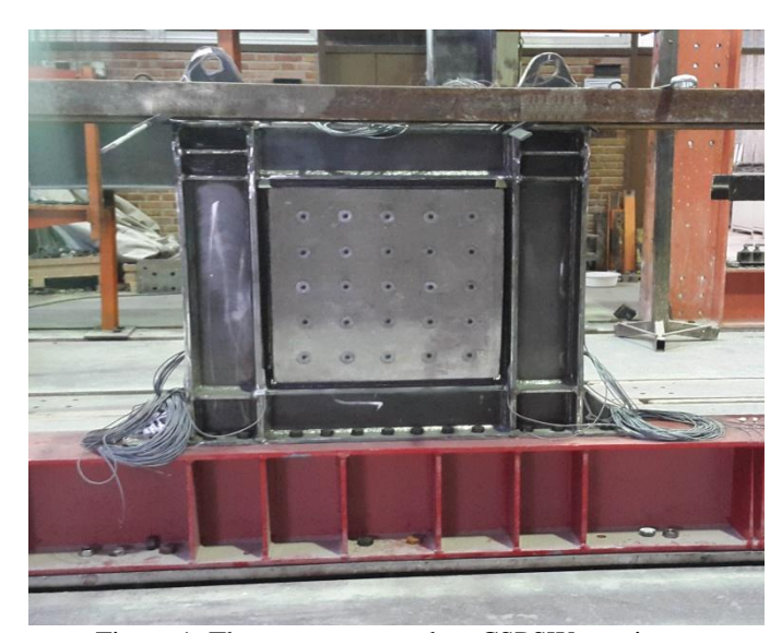
Figure 1. The one-story one-bay CSPSW specimen

The infill steel plate has a yield stress of 200 MPa and the boundary elements have a yield stress of 246 MPa. The reinforced concrete panel was precast concrete, and the nominal compressive strength (f<sup>°</sup>c) was 25 MPa.